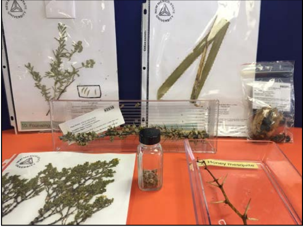
Fourth graders use hand magnifiers and desert plant specimens to help understand plant structures and functions in Asombro's new lesson.

In typical Asombro fashion, we put the local spin on this standard by having students learn about herbaria and gather evidence to help Fou understand the most common sp shrub in our area: creosote bush ( Larrea tridentata ). Using beautiful specimens prepared by Dr. Fuentes-Soriano's team, students gather evidence from leaves, stems, fruits, and seeds in a variety of desert plants. They then use this