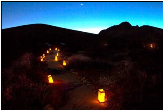
More than 300 luminarias light up the Chihuahuan Desert Nature Park's trail.