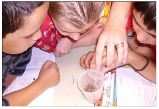
During the "Soil - It's Not Just Dirt" class program, students conduct an experiment investigating water infiltration rates into different soil types.

Regardless of the topic, all programs share several traits. All are hands-on and inquiry-based, allowing students to learn by <u>doing</u>. All programs are also tied directly to state science and math education standards, thereby assisting teachers with their required curriculum.