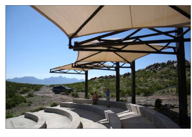
A beautiful new shade structure was installed above the Chihuahuan Desert Nature Park amphitheater in late August.

He said, "We waited a long time for this structure, but it was worth the wait."