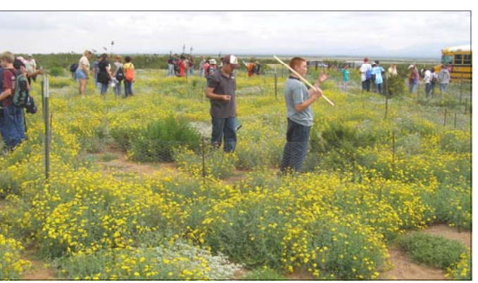
For several years, students in the Sierra Middle School Science Magnet program have learned about science and the desert by collecting data on plant restoration at the Asombro Institute's Chihuahuan Desert Nature Park.

For more information on the No Child Left Inside movement, including progress of H.R. 3036, please visit the No Child Left Inside Coalition's web site (http://www.cbf.org).