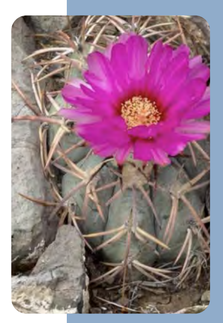
Many cactus species are found at the Chihuahuan Desert Nature Park, including this Turk's Cap Cactus.

It may be tempting to add some of these beautiful cacti you find in the desert to the landscaping around your home, but illegal harvesting of cacti depletes wild populations, disrupts ecosystems, and deprives wildlife of their natural habitat. There are rules regulating plant harvesting throughout the southwest, so it is important to understand the regulations in your area. More information can be found in this Ethics of Native Plant Acquisition brochure (http://agrilife.org/elpaso/files/2011/10/Plant-Acquisition-Ethics1.pdf) provided by the TexasAgriLIFE Extension Office of El Paso County.