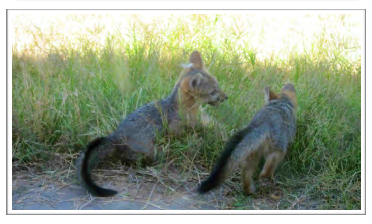
This spring, Asombro staff got to watch six grey fox (Urocyon cinereoargenteus) pups being raised near our office. The bundles of energy were hard to capture on film because they never stopped moving!

Calling all summer and fall declutterers! We want your gently used items for Asombro's first Garage Sale, hosted by the Board of Directors. All proceeds of the October 31 sale will support Asombro's education programs. Call the office for details on donating your items.