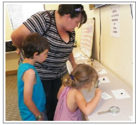
Young scientists get a close look at some Amazing Arthropods at the Bayard Public Library in May.

Programs included Fossils at Capitan and Hatch libraries. Desert Animals at Columbus and Tularosa libraries. Amazing Arthropods at Bayard and Deming, and Bats! at Doris Van Doren Library in El Paso. Asombro was also part of the kick-off ceremony for the