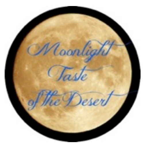
Reserve your tickets now for Moonlight Taste of the Desert, a fundraiser in support of the Asombro Institute for Science Education.