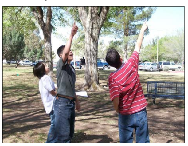
Students conducted a bird point count during the first spring break camp hosted by the Asombro Institute for Science Education.

During the camp, participants engaged in 40 activities to learn about climate, weather, rocks, soil, arthropods, birds, and field ecology techniques. Emphasis was placed on getting students outside as much as possible to complete activities, and all activities (indoor and outdoor) were hands-on. Students collected data each day and learned how their data fit with data collected by professional scientists in the region. Because the camp took place over spring break, Asombro Institute staff members also made sure to include several science-related art projects and games.