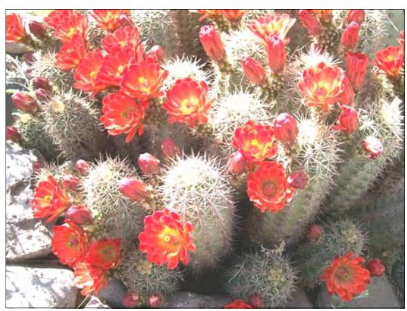
Beautiful red claret cut hedgehog cactus flowers can now be spotted by Chihuahuan Desert Nature Park visitors.

other colors. Hours later, male ants will be swarming, looking for females to mate. Days later, annual plants will be vigorously sprouting and perennial shrubs will seem to fill their tissues with water. Everything responds on their own timescale, and you'll notice something new or different every year. This is what the Chihuahuan Desert Nature Park can offer everybody, of all ages – the amazing cycles of life and complex interactions of different organisms, happening right in front of us.