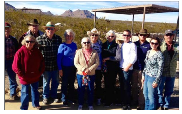
We love Asombro volunteers! Join these fantastic folks (and many more) by contacting us today.

No experience with education or trail maintenance necessary. Call 575-524-3334 or email <u>information@asombro.org</u>. Together we can make a difference!