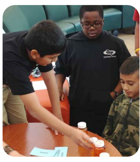
Science Interns become science experts throughout the semester and then share their knowledge with younger students. They gain science knowledge as well as presentation and leadership skills.

Children's Foundation (Santa Fe). Based on the early success of the project, Asombro will expand Science Interns to eight schools in the 2013/14 school year. Funding for the expanded program has already been provided by the Wolslager Foundation (San Angelo, Texas).