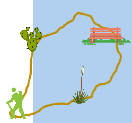
A total of 1.1 miles of new hiking trail for you to discover!

2nd Grade Student During Wildlife Wonders Lesson