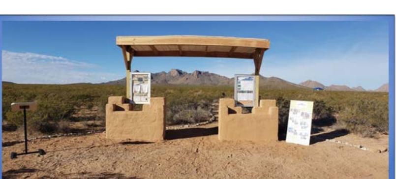
48 volunteers contributed over 200 hours to help Asombro staff complete Gateway to the Desert, which included lining the new 0.5-mile Yucca Trail and 0.6-mile Gateway Loop Trail and building a welcome kiosk.

Now it's your turn! Grab your two- and four-legged family members and hit the new trails. Along the way, contribute to the photo-monitoring project, learn about unique plant and animal adaptations, enjoy a breathtaking view of the San Andres Mountains, watch birds from the new benches, and document your time by taking a photo at the new kiosk.