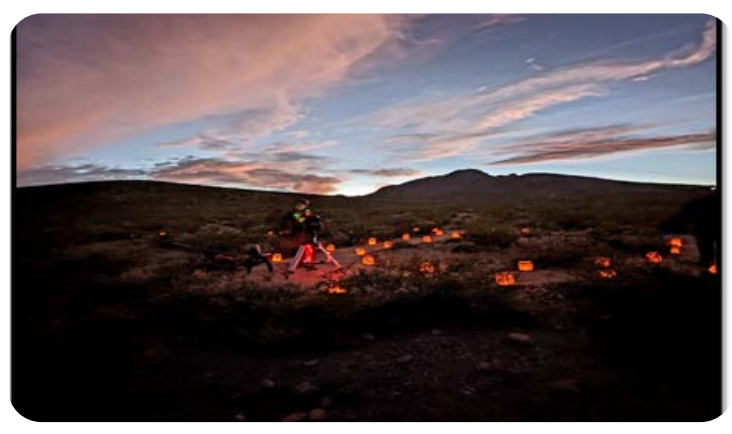
After a two-year hiatus, over 100 visitors attended Asombro's "Luminarias: Light Up the Desert!" event held on the evening of December 9.