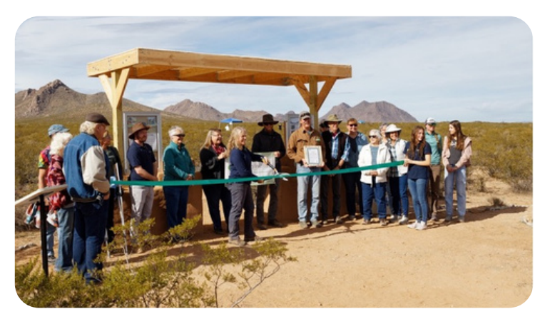
On December 3, Asombro volunteers, staff, board members, community members and visitors gathered at the Chihuahuan Desert Nature Park to celebrate the opening of the new Gateway to the Desert Trail.