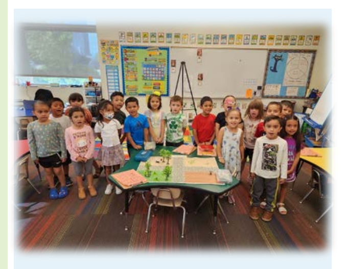
Kindergarteners create a mock playground to aid in understanding temperature differences in Sun and Shade.

Additionally, 2022 brought the creation of Gateway to the Desert (see the next page of this newsletter) and our first public programs at the Chihuahuan Desert Nature Park in more than two years. On December 9, we re-established proof that the most beautiful place to light luminarias is along our trail under the desert night sky.