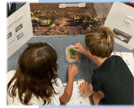
Students discover what types of amphibians live in the desert while circling various species on data sheets.

The Desert Data Jam final competition will occur in person in late April. If you are interested in helping to judge this unique competition, please contact kelly@asombro.org. No experience is needed.