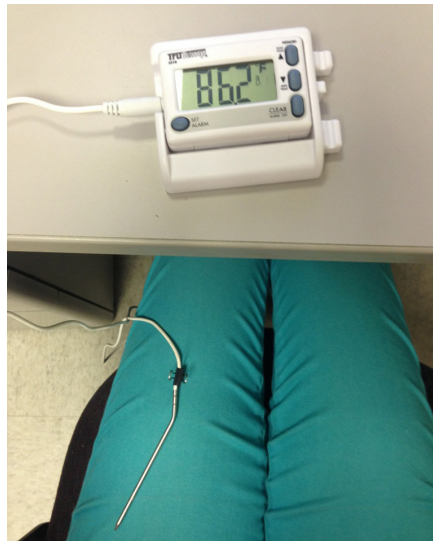
Figure 3. Meat thermometer set up

probe should not be pointed sideways or hanging off of the student's lap.