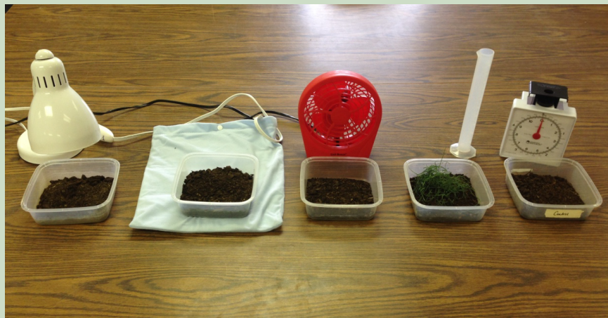
Figure 2. Five experimental containers with treatment materials (left to right): heat lamp, heating pad, desktop fan, Spanish moss, and control