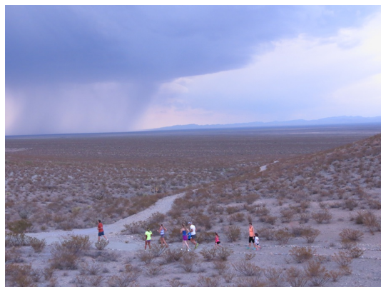
Spectacular views and wonderful company await you at the Desert Dash Trial Race.