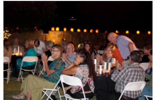
A good time was had by all who attended our Moonlight Taste of the Desert Dinner in September.

The Asombro staff and Board have been hard at work with education programs, yet we still found time for fundraising.