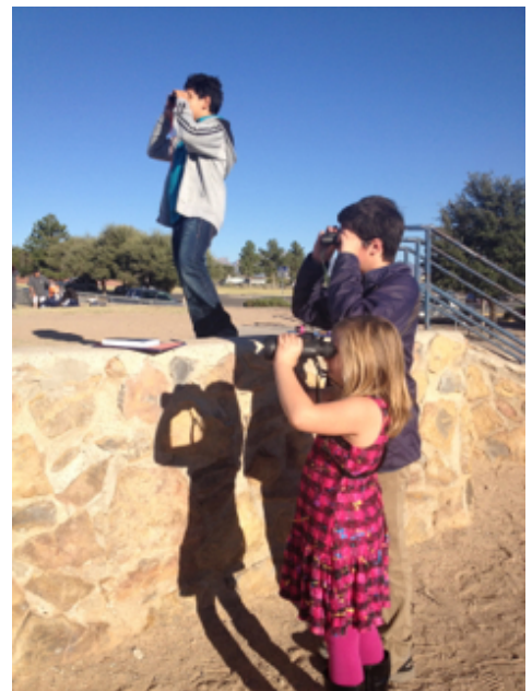
Vista Middle School students go birdwatching in their Science and Action afterschool program.