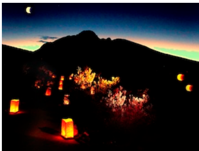
Luminarias at dusk.

The event is free and will take place on December 14th from 5-7pm. We will light the luminarias at 5:00pm. Kids can decorate their own luminaria and add it to the trail. Enjoy free hot chocolate and Christmas music. Be sure to bundle up, and bring water and a flash light.